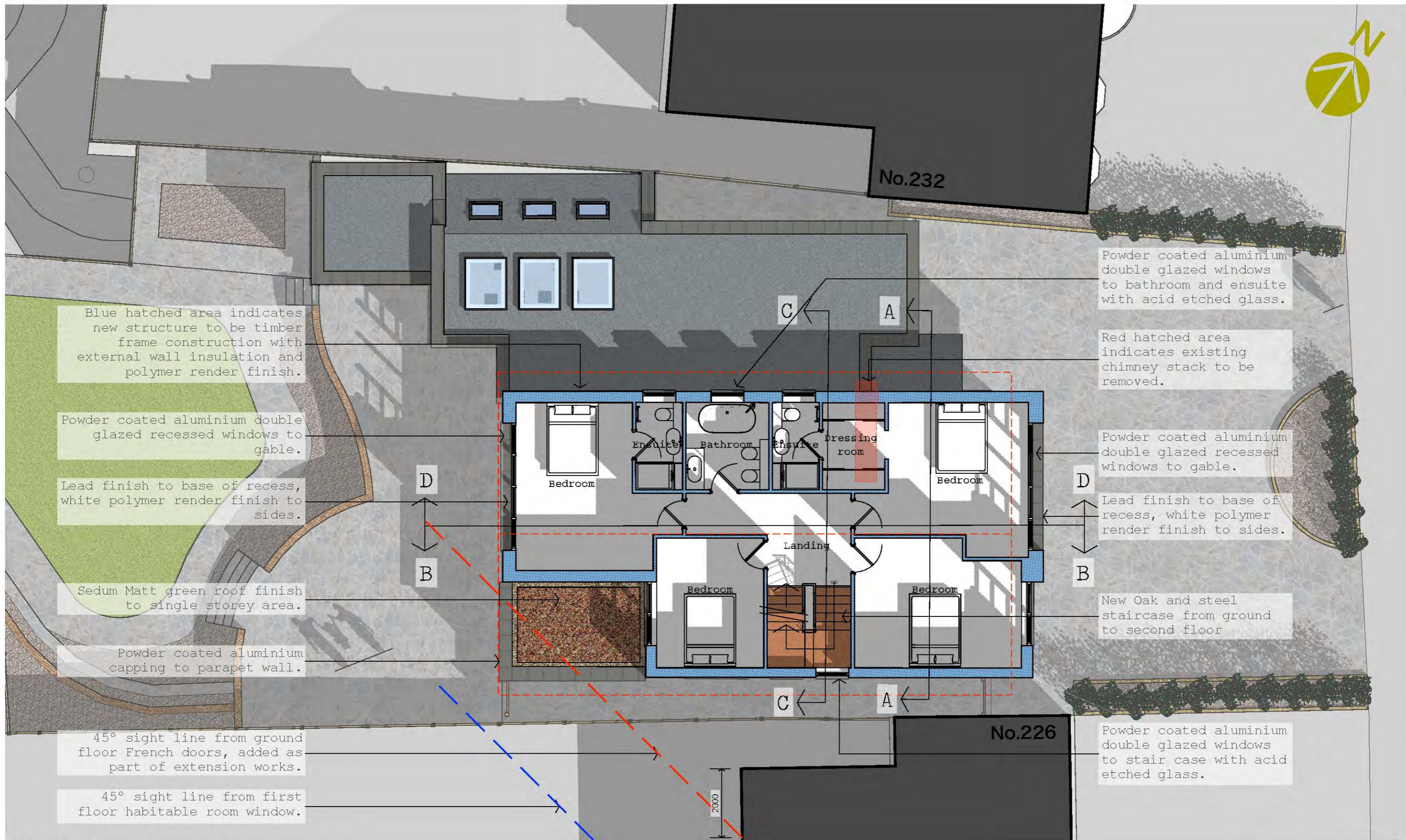
First Floor Layout as proposed